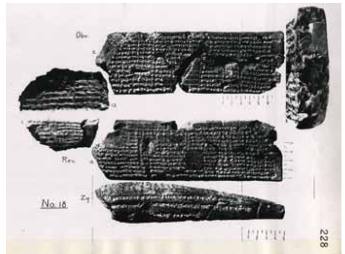
Fig. 2: Table of new and full moons for S.E. 263/49-48 B.C.E. and designated „tersētu of Naburimannu”, published in O. Neugebauer, Astronomical Cuneiform Texts (1955), No. 18.

Before Alexander entered Babylon, there is little convincing evidence to point to for Greek awareness of Babylonian astral science. After that date, however, Hellenistic Greek writers gave explicit priority in the astronomical sciences to both Babylonia and Egypt in a vague sort of way. Aristotle said the Egyptians and Babylonians „made observations from a very great number of years” and had provided „many reliable data for belief about each of the planets.” [ Caelo 291b34 – 292a9] In his Bibliotheca Historica [Bk 2. 31.9] Diodorus of Sicily in the 1 st century B.C.E. assigned a value to this „great number of years,” saying „as to the number of years which, according to their statements, the order of the Chaldeans has spent on the study of the bodies of the universe, a man can scarcely believe them; for they reckon that, down to Alexander’s crossing over into Asia, it has been four hundred and seventy-three thousand years since they began in early times to make their observations of the stars.” Roughly a century later, Pliny, in his Natural History , invoked Epigenes as an