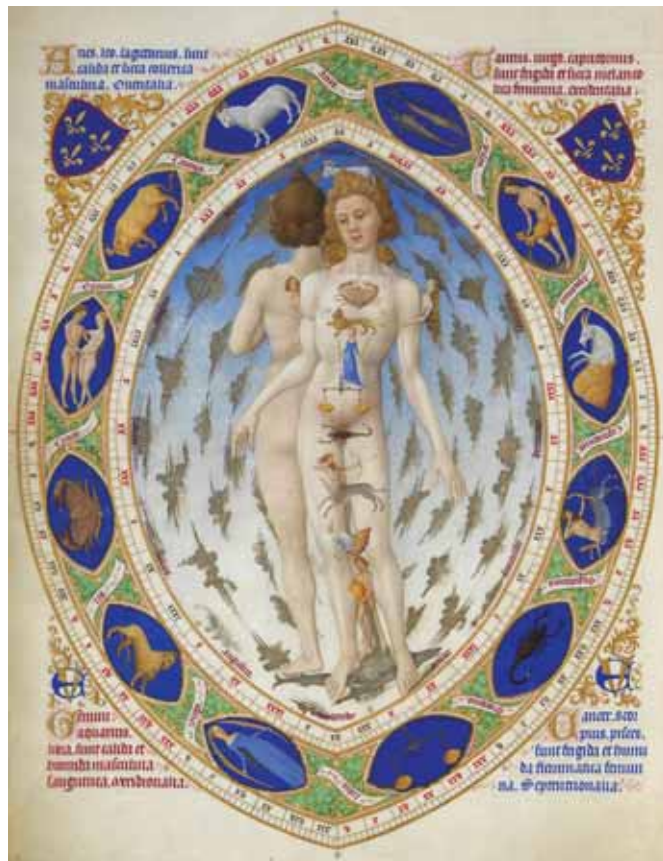
Fig. 5: Illumination of the melothesia (zodiacal man) from the Book of Hours of the Duke of Berry

The rich and detailed nature of the transmission of Babylonian astral sciences to the Greeks must, however, be seen against some fundamental differences between the Babylonian and the Greek world systems. For example, the horoscopus , or rising point of the ecliptic at the moment of birth, as it is known from Greek and later European horoscopy was not a feature of cuneiform „horoscopes.“ Nor was the conceptual basis for the horoscopus , i.e., the sphere and the continuously moving great circle of the ecliptic, at home in Babylonian astronomy. The physical theory by which Ptolemy [Tetr. I.2 and 24] explained stellar influence in terms of planetary rays, or the power of the aether that is „dispersed through and permeates the whole region about the earth“ is equally absent from Mesopotamia. Physical influence from the stars may be implied in the Babylonian magical corpus when potions and medications must be left out overnight before use, but stellar irradiation of substances does not find its way into cele-